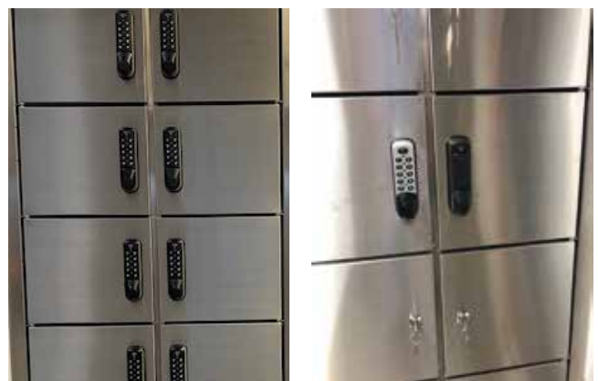
Lock types available, including: fob, digital, key pad and key.